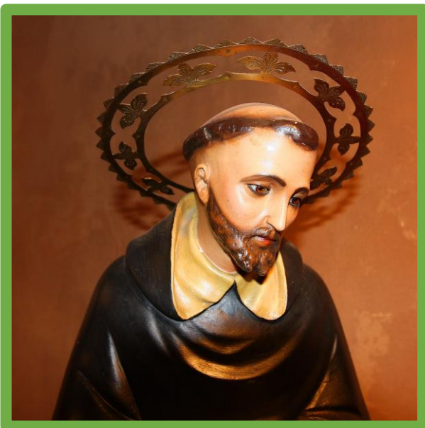
St Dominic our Patron Saint